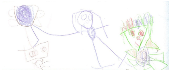
My Robot is vacuuming the carpet.