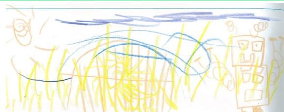
My robot is catching a lion in Africa. By Tai Horton